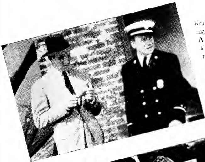
Bruce Cabot plays the main lead in "Night Alarm" (T 9661 - 6 reels) - the story of the newspaper reporter who reveals the identity of a mysterious fire-raiser.